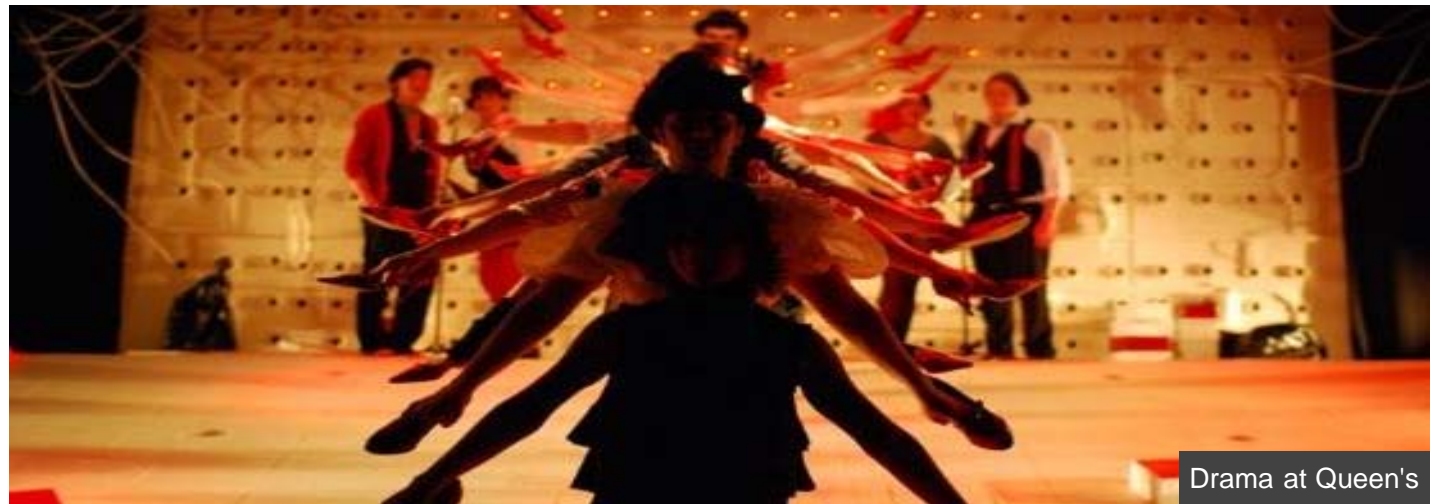
Drama at Queen's